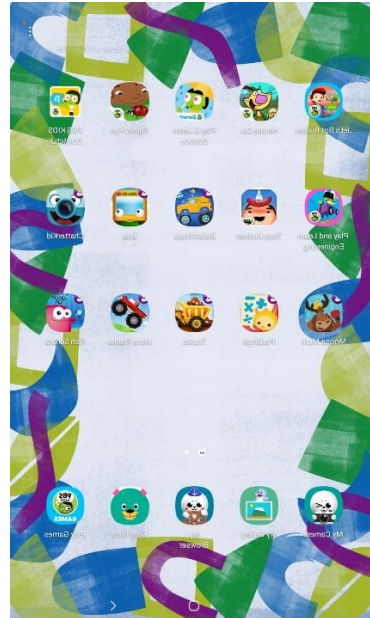
Kids Mode Background

To enter KIDS mode or TEACHER mode: Enter the password 1234.